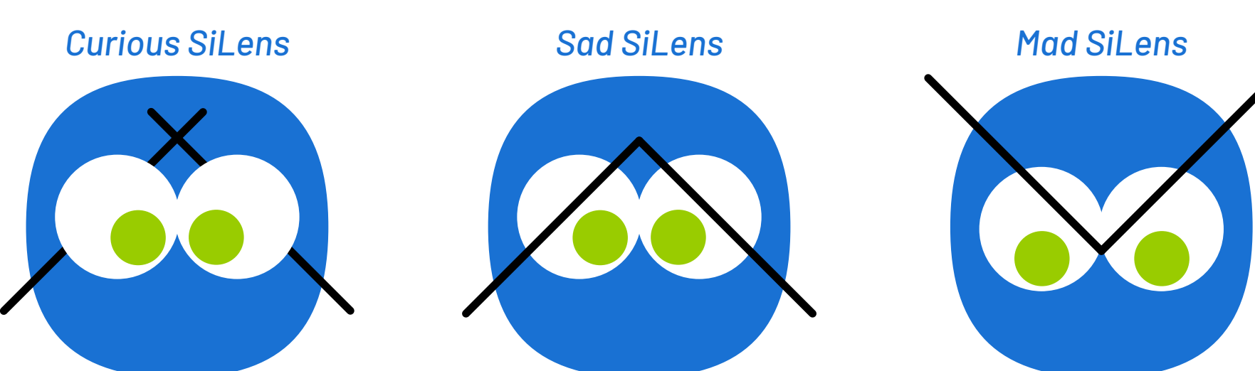
SiLens in different moods SiLens 的每日心情

Upcoming Features for SiLens 下一代 SiLens 将配备的功能