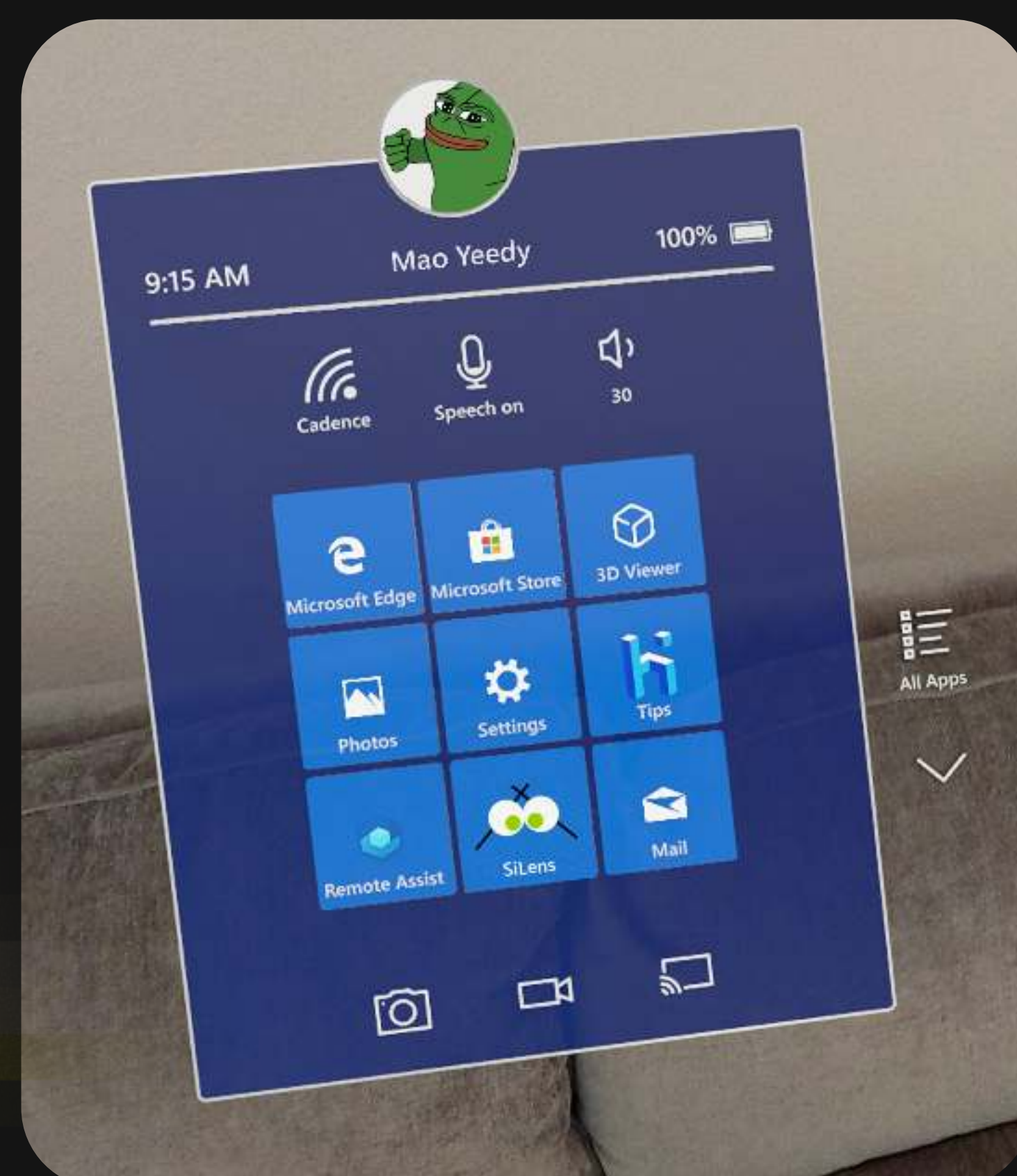
SiLens embedded into Hololens SiLens 图标嵌入 Hololens 界面

On toggling this button, you decide whether a member is blocked or not. Would be useful if you need to see someone temporarily.